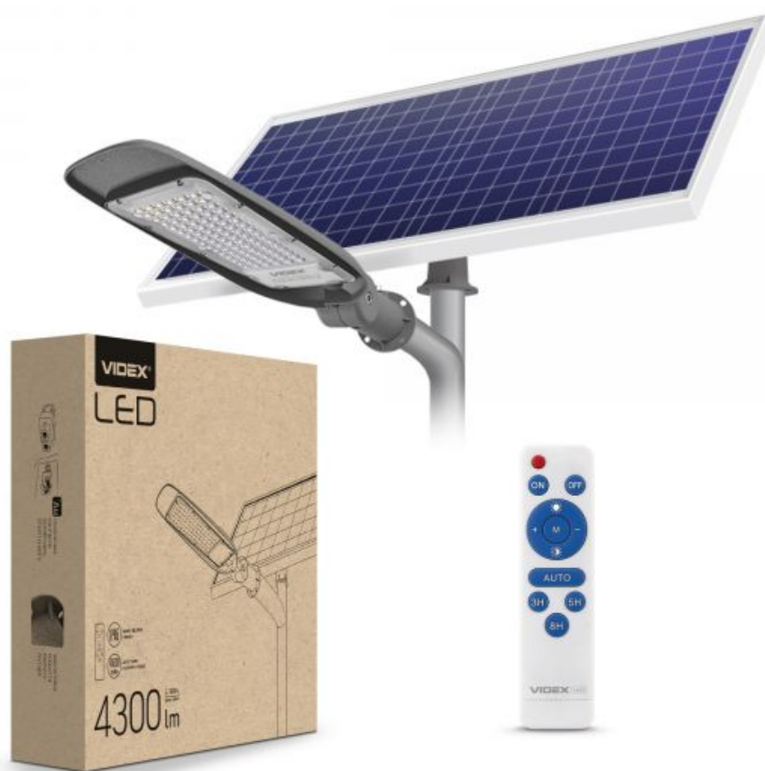
LED Solar Street light