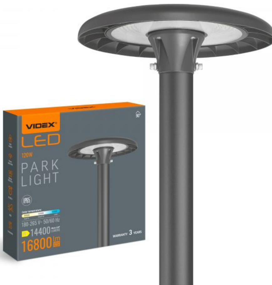
LED Park Light