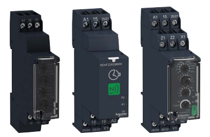
RE17, RENF, RE22

Depending on the product model, these relays support multiple time ranges. > Modular DIN rail mounted timing relays