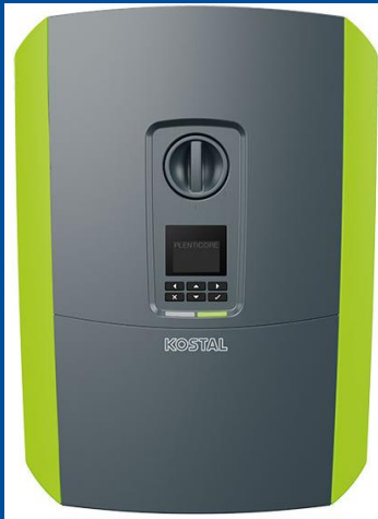
Invertor Kostal Hybrid