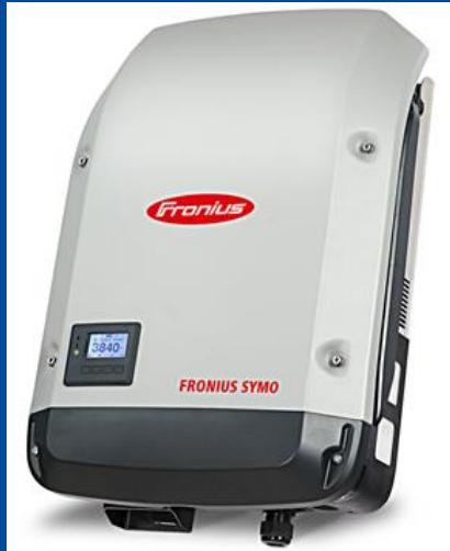
Invertor Fronius Symo