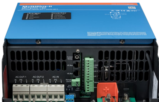
Connection Area MultiPlus-II 3k