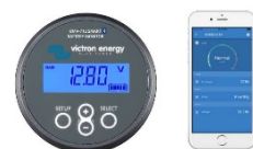
BMV-712 Smart Battery Monitor The BMV Battery Monitor features an advanced microprocessor control system combined with high resolution measuring systems for battery voltage and charge/discharge current. Besides this, the software includes complex calculation algorithms, like Peukert's formula, to exactly determine the state of charge of the battery. The BMV selectively displays battery voltage, current, consumed Ah or time to go. The monitor also stores a host of data regarding performance and use of the battery.