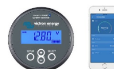
BMV-712 Smart Battery Monitor The BMV Battery Monitor features an advanced microprocessor control system combined with high resolution measuring systems for battery voltage and charge/discharge current. Besides this, the software includes complex calculation algorithms, like Peukert's formula, to exactly determine the state of charge of the battery. The BMV selectively displays battery voltage, current, consumed Ah or time to go. The monitor also stores a host of data regarding performance and use of the battery.