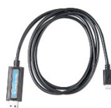
VE.Direct to USB interface Connects to a USB port.