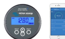
BMV-712 Smart Battery Monitor The BMV Battery Monitor features an advanced microprocessor control system combined with high resolution measuring systems for battery voltage and charge/discharge current. Besides this, the software includes complex calculation algorithms, like Peukert's formula, to exactly determine the state of charge of the battery. The BMV selectively displays battery voltage, current, consumed Ah or time to go. The monitor also stores a host of data regarding performance and use of the battery.