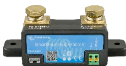
Bluetooth sensing: SmartShunt