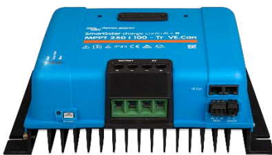
SmartSolar Charge Controller MPPT 250/100-Tr VE.Can without display