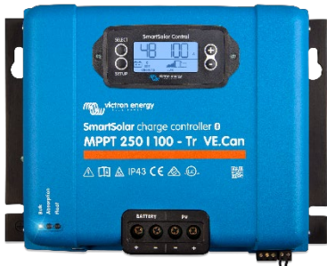
SmartSolar Charge Controller MPPT 250/100-Tr VE.Can with optional pluggable display