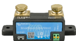
Bluetooth sensing: SmartShunt