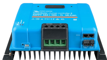
SmartSolar Charge Controller MPPT 150/100-Tr VE.CAN without display