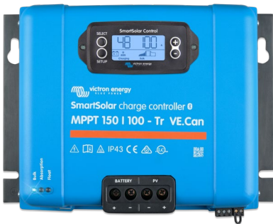
SmartSolar Charge Controller MPPT 150/100-Tr VE.Can with optional pluggable display