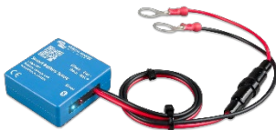
Bluetooth sensing Smart Battery Sense