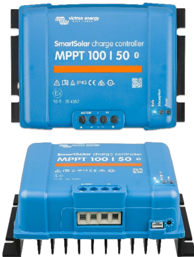
SmartSolar Charge Controller MPPT 100/50