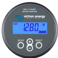
Bluetooth sensing BMV-712 Smart Battery Monitor