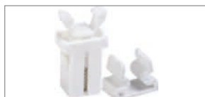
Latching lock and blank insert for the lock