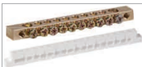
N/PE busbars, support for N/PE busbars