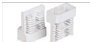
Stepped holders for DIN rail