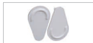
Plastic blank covers for mounting holes