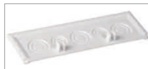
Insert for SCHRN enclosures