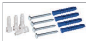
Plastic screws, wall plugs