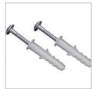
Screw-bolts and plastic dowels.