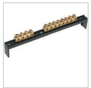
Support with N and PE buses.