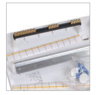
Special support for N and PE can be easily dismounted and installed both in the upper and lower parts of the box base. This support is made of self-extinguishing material (even at 960 °C).

Individual packaging not only protects the case from mechanical impact but also informs the consumer on IEK® products advantages.