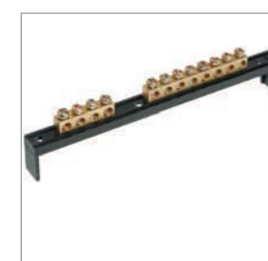
Support with N and PE buses.