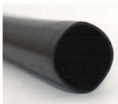
Tub termocontractibil ignifug - perete subțire 2:1