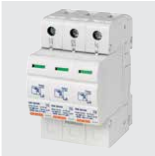
GW D6 426

CHARACTERISTICS: SPDs are equipped with extractable cartridges with optic end-of-life signal.