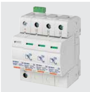
GW D6 420

CHARACTERISTICS: SPDs are equipped with extractable cartridges with optic end-of-life signal.