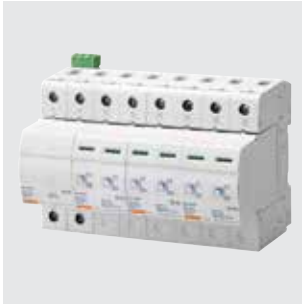
GW D6 405