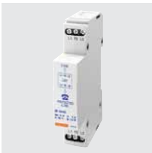
GW D6 430

CHARACTERISTICS: SPDs are equipped with extractable cartridges with optic end-of-life signal.