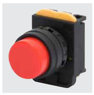
GW 74 311

\textbf{CHARACTERISTICS:} \ Also \ compatible \ with \ the \ water tight \ emergency \ enclosure \ GW42204 \ and \ GW42207.