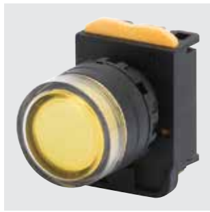
GW 74 345

CHARACTERISTICS: Also compatible with the watertight emergency enclosure GW42204 and GW42207.