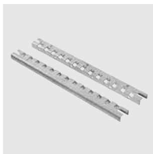
GW 46 437 F

ACCESSORIES SUPPLIED: fixing accessories.