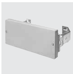
GW 46 425 F