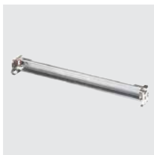
GW 46 431 F

APPLICATIONS: the uprights make it possible to implement extractable frames by using: panels without and with windows, perforated or non-perforated plate with height of 1 or 2 modules, MCCB or switch disconnector kits.