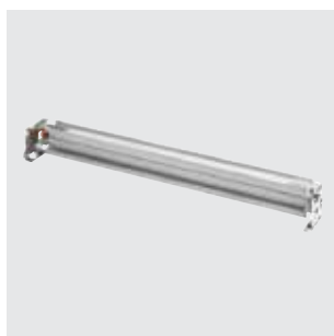
GW 46 531 F

To restore the minimum degree of protection of the open door board, use the relative inner door.