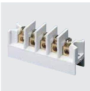
GW 44 608