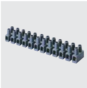
GW 44 601