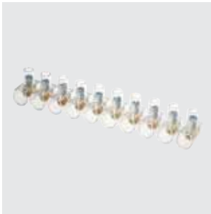
GW 44 665