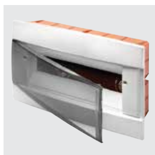
GW 40 229 TB