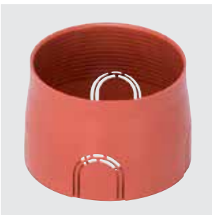
GW 24 208

CHARACTERISTICS: GW24232, fitted for single or double installation, with centre distance composition of 71mm (or 91mm with the special spacer available as an accessory). Supplied with 2 fixing screws.