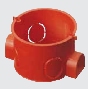
GW 24 232