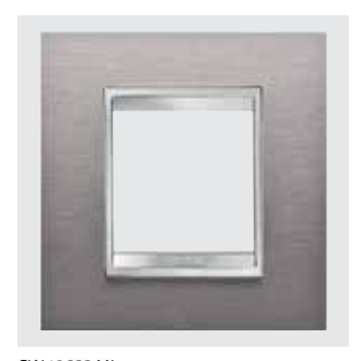
LUX INTERNATIONAL - BRUSHED STAINLESS STEEL