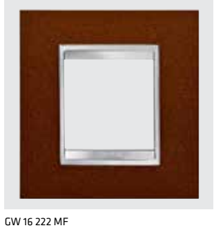
LUX INTERNATIONAL - OXIDISED FINISH