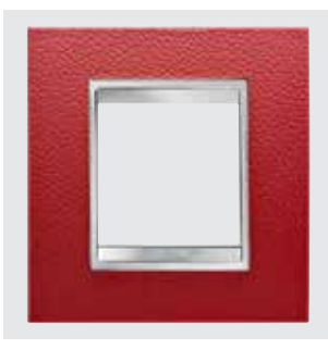
LUX INTERNATIONAL - RUBY