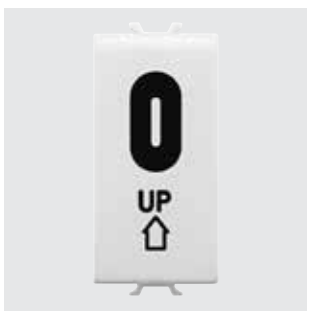
GW 10 908

CHARACTERISTICS: possibility of remote control with NO-type push-buttons and touch command duplicator modules GW10909. A simple programming allows you to configure the acoustic signals (buzzer), light intensity signals (blue LED with two intensity levels), and the output contact (bistable or monostable). NO relay output contact with 230V AC potential. Suitable for commanding halogen and incandescent lamps: 500W, energy saving lamps: 100W (max. 4 lamps), uncompensated fluorescent lamps: 100W. Use a supply relay for all loads that are not indicated. NOTES: to be completed with ICE Touch glass plate (cod. GW16951CB, GW16952CB, GW16953CB, GW16953CN, GW16953CN, GW16951CT, GW16952CT, GW16952CT).