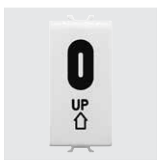
GW 10 909

To be completed with ICE Touch glass plate (cod. GW16951CB, GW16952CB, GW16953CB, GW16951CN, GW16952CN, GW16953CN, GW16953CN, GW16953CN, GW16953CT).