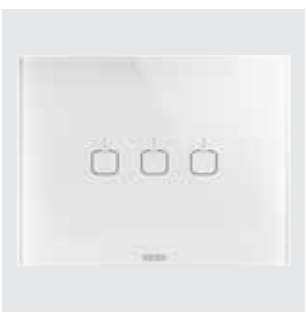
GW 16 953 CB