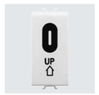
GW 10 907