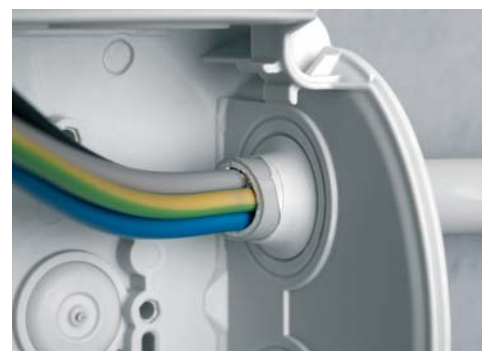
cable entry via integrated elastic membranes in box walls for fast cable entry up to degree of protection IP 66