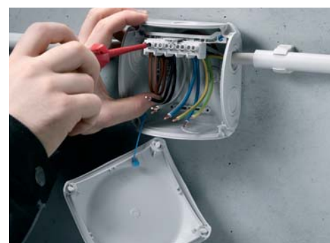
retaining strap prevents the lid from falling or losing and makes daily installation work easier