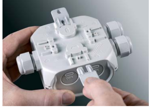
external brackets for fastening are always included