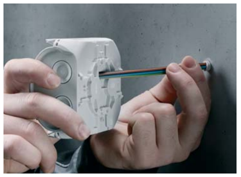
cable entry through the bottom of the box via integrated elastic membrane