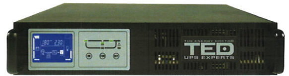
Modelul 1000VA contine acumulatori interni