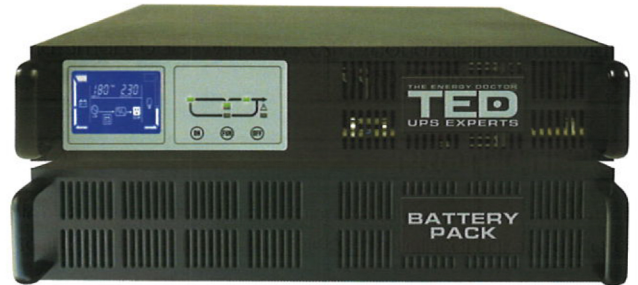
Modelele 2000VA si 3000VA au acumulatori externi (rack-ul inferior)