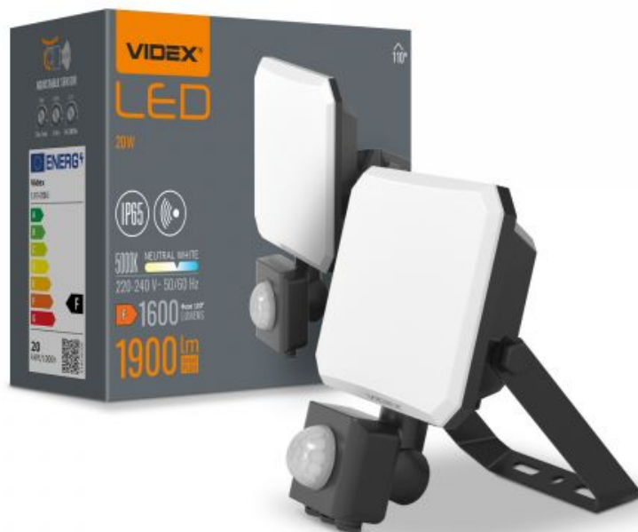
LED Floodlight with motion sensor