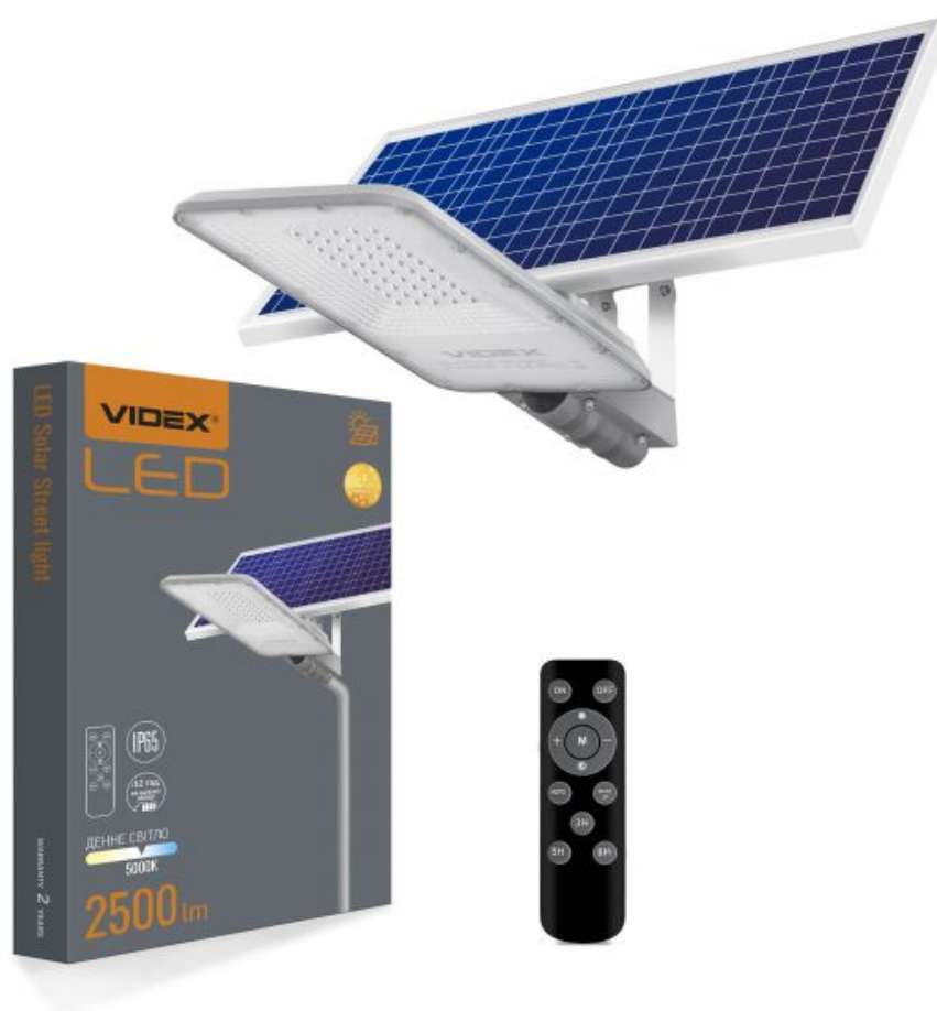
LED Solar Street light