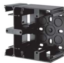
extension module 93x86x45 mm VF-BNMB2-B