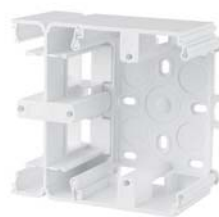
extension module 93x86x45 mm VF-BNMB2-W