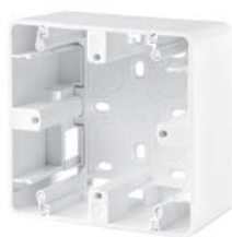
complete box size: 86x86x45 mm VF-BNMB1-W