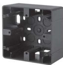
complete box size: 86x86x45 mm VF-BNMB1-B