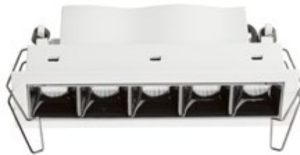
SWAN | 9232126