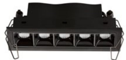
SWAN | 9232127