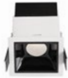
SOREL | 9050920