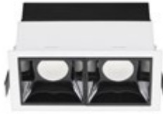
SOREL | 9065023

Driver 7 Watt Input: 100-240V AC 50/60Hz Output: 12-24 VDC 350mA Not Dimmable