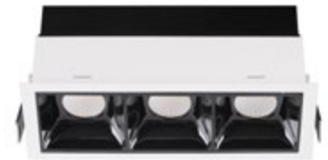
SOREL | 9065121

Driver 13 Watt Input: 100-240V AC 50/60Hz Output: 25-42 VDC 350mA Not Dimmable