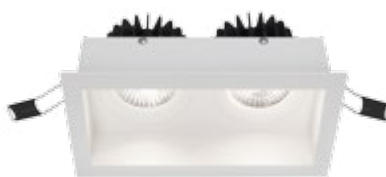
OLBIA | 8033409