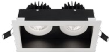
OLBIA | 8059409

Driver 12W Eaglerise Input: 100-240V AC 50/60Hz Output: 12-24VDC 500mA Not Dimmable