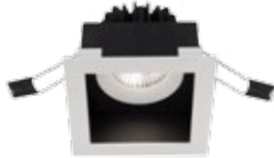
OLBIA | 8016909