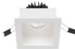
OLBIA | 8001402