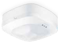
Surface-mounted version (AP)

Refer to the 'Accessories' section for further information.