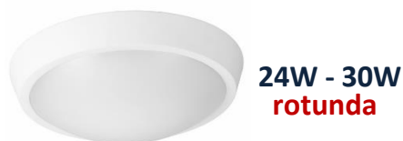
24W - 30W rotunda