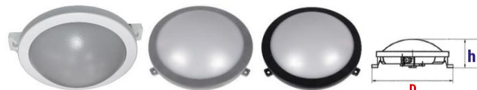
ROTUND 6W - 10W - 12W - 15W