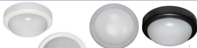
10W - 18W