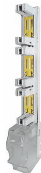
PBS 00/100 mm