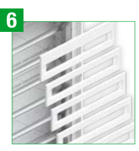
Functionality Modular panels

Removable chassis , allowing the electrification outside the enclosure.