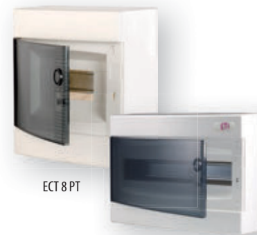
ECT 8 PT