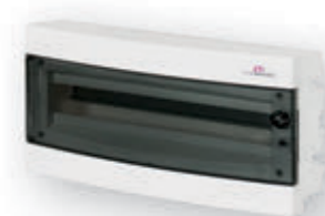
ECM 12 PT