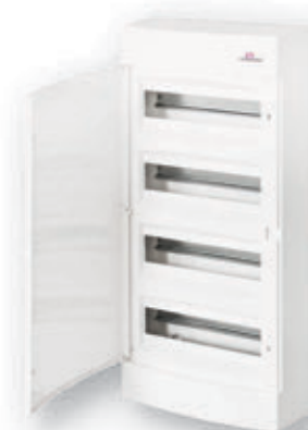
ECT 48 PO