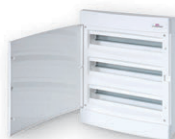
ECM 36 PO